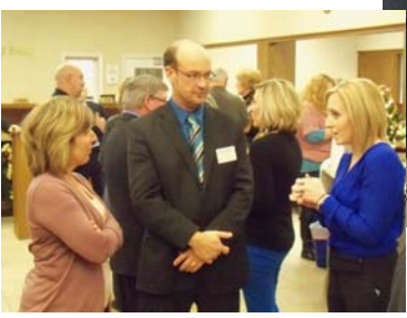
A large crowd enjoyed the festivities and the opportunity to socialize.

The event was catered by 2 Martha's—a new business located in Greenville.