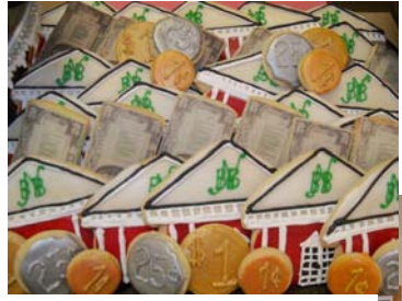
The Sweetest Things provided custom cookies.