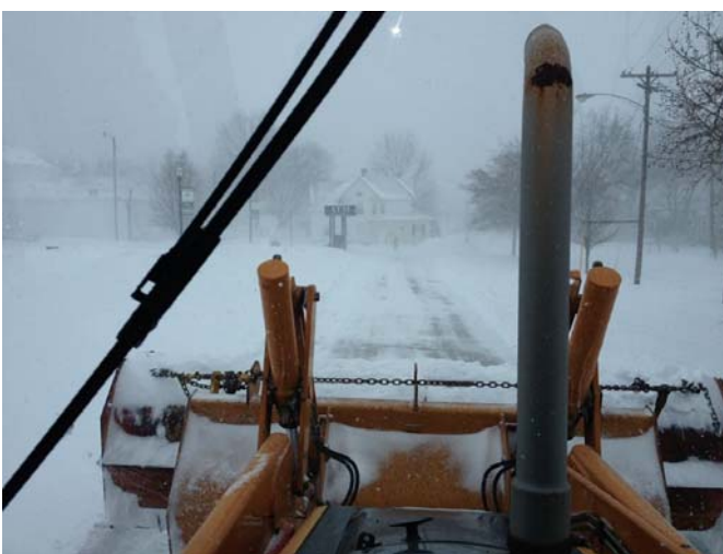
Slatton's Excavating of Greenville worked double time to ensure the BNB lot was cleared for business during the most recent snowstorm.